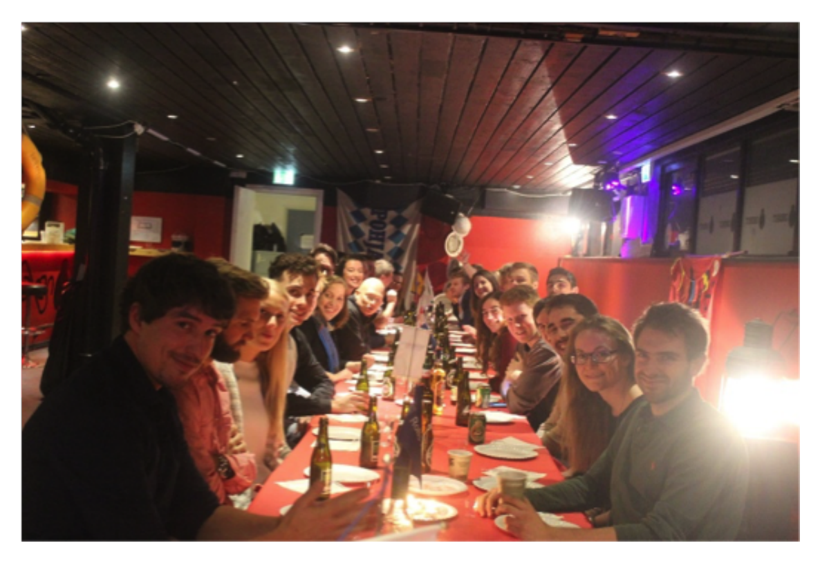
Figure 13: Both old-timers and students gathered for a cheerful evening.

The fun lasted all night long, and everybody had a great night and loads of memories.