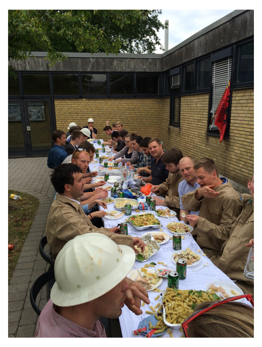
Figure 6: The nice weather allowed us to enjoy the well-cooked dinner outside.

As previous years a much cherished event was hosted by Nul-Kryds: the Martha evening. A lot of energy was put into preparing the garden outside of building 402, to frame the festivities of this evening. This included maritime flags in the trees, the traditional table cloth depicting the good ship S/S Martha and much more. After all attendees had arrived the festivities were moved into a close by auditorium, where we watched the cult classic S/S Martha as always this involved plenty of cheerful songs. As tradition dictates O.P.Andersen snaps was readily available, as well as soda and beers. Later the activities moved out into the garden again, where the Nul-Kryds board had prepared a feast. The food included pulled pork, coleslaw and buns for building a nice burger. The festivities went on well into the night, leaving plenty of room for socializing with friends, colleges and other students. Also activities like anchor throwing and nail-games were practiced throughout the evening. We look very much forward to hosting the next Martha evening. We have no doubts that it will provide an equally good atmosphere and hopefully help the social environment on our line of education.