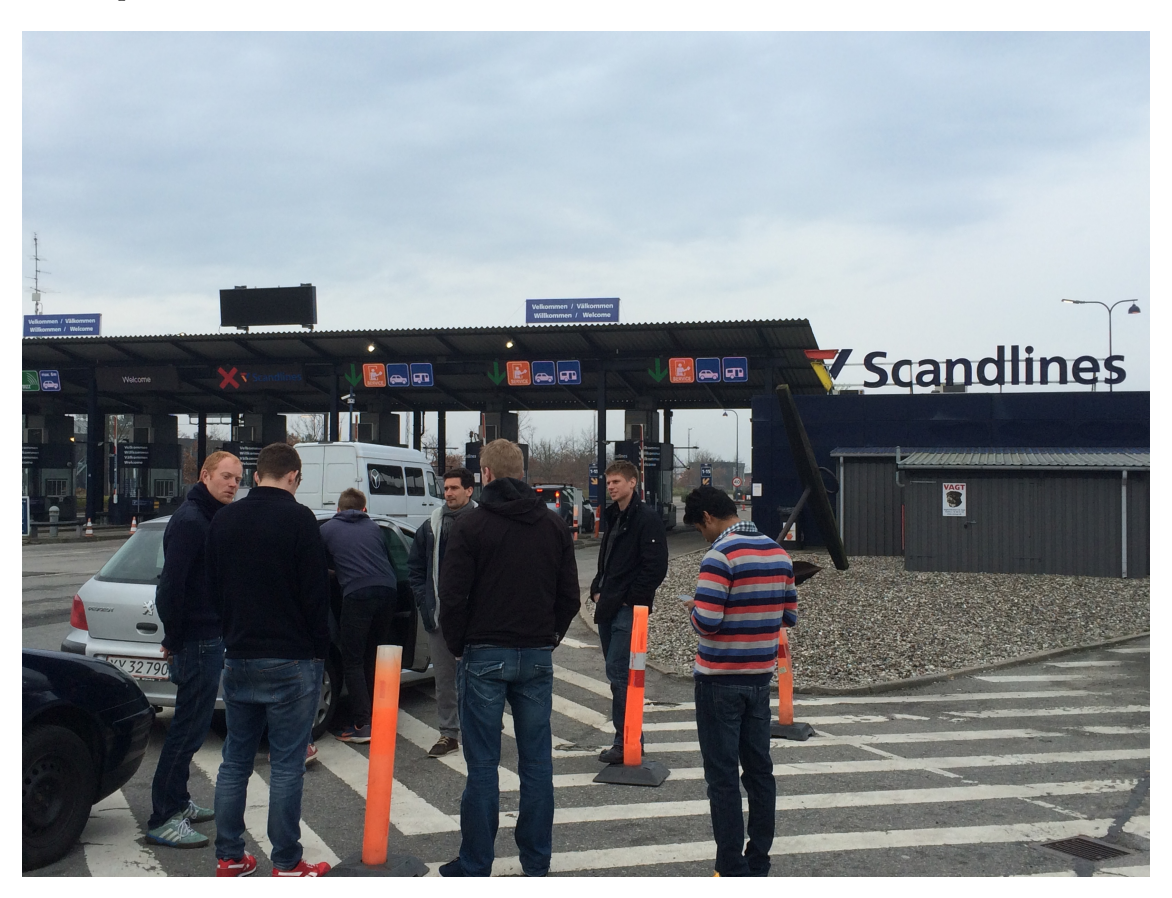
Figure 2: Morning fresh students ready to embark the M/F Prinsesse Benedikte.

During the crossing from Rødby to Puttgarden with Prinsesse Benedikte the chief engineer kindly hosted a fine breakfast combined with a technical presentation of the hybrid system. First the considerations during the development and installation of the system were presented, followed up with a real time look at the system as the ferry left the harbor. During acceleration in the shallow water the system really showed its fuel saving possibility as lots of the required power were provided by the batteries. Following the presentation, the group went down into the engine room and had a look at the two generators running and the battery pack, taking op the space where a generator was installed previously. Many questions were asked, the cooling of the batteries gained much attention as well as the actual fuel savings. Compared to the first year of service in 1997 the fuel consumption was reduced to almost half the amount.