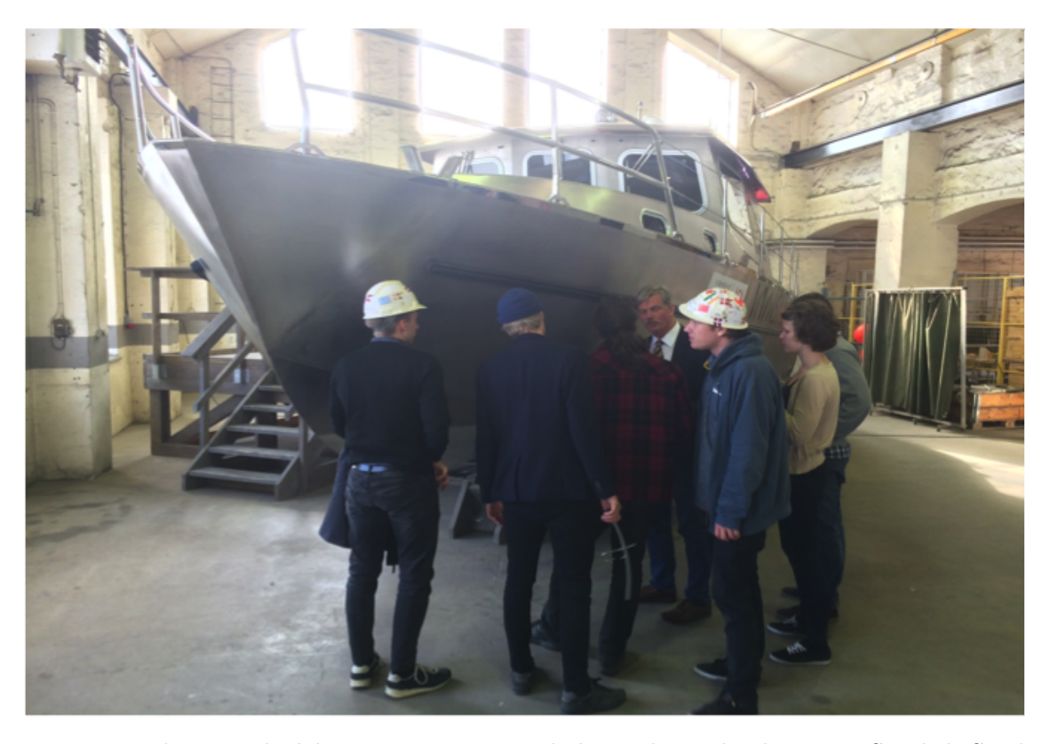
Figure 4: The Danish delegates inspecting a lightweight yacht design at Swedish Steel Yachts.

The 69th Nordiske Tekniska Högskolas Skibbsbyggare (NTHS) congress was hosted by Kongliga Skeppssälskapet from KTH Royal Institute of Technology in Stockholm during week 15 of 2016. During the congresss, a wide variety of companies were visited along with fun-packed activities and interactions among the participants. Through the company visits the delegates explored the recent developments in the swedish maritime industry focusing on state-of-the-art yacht designs, lightweight materials, underwater craft solutions and alternative propulsion devices, among other exciting technologies.