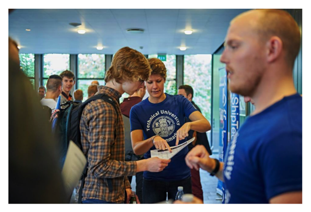
Figure 10: Nul-Kryds members guiding student collegues at Tech Event.

In late october Nul-Kryds participated in a game-night to test the "TECH game" that was to be played by participants in Det Blå Danmarks 'TECH event'. The game should give an introduction to the many different aspects of and career opportunities for engineers within the maritime field. The "TECH game" is played in teams, it is fast paced and the players must relate to a lot of different material in relatively short time. In the end the team that chose a 'project leader' and divided the tasks to 'specialists' won the game, albeit scores were tight until the very end. After having been played, the game was discussed and several recommendations were given. For Nul-Kryds this was a completely new thing to participate in, but it was a very fun experience.