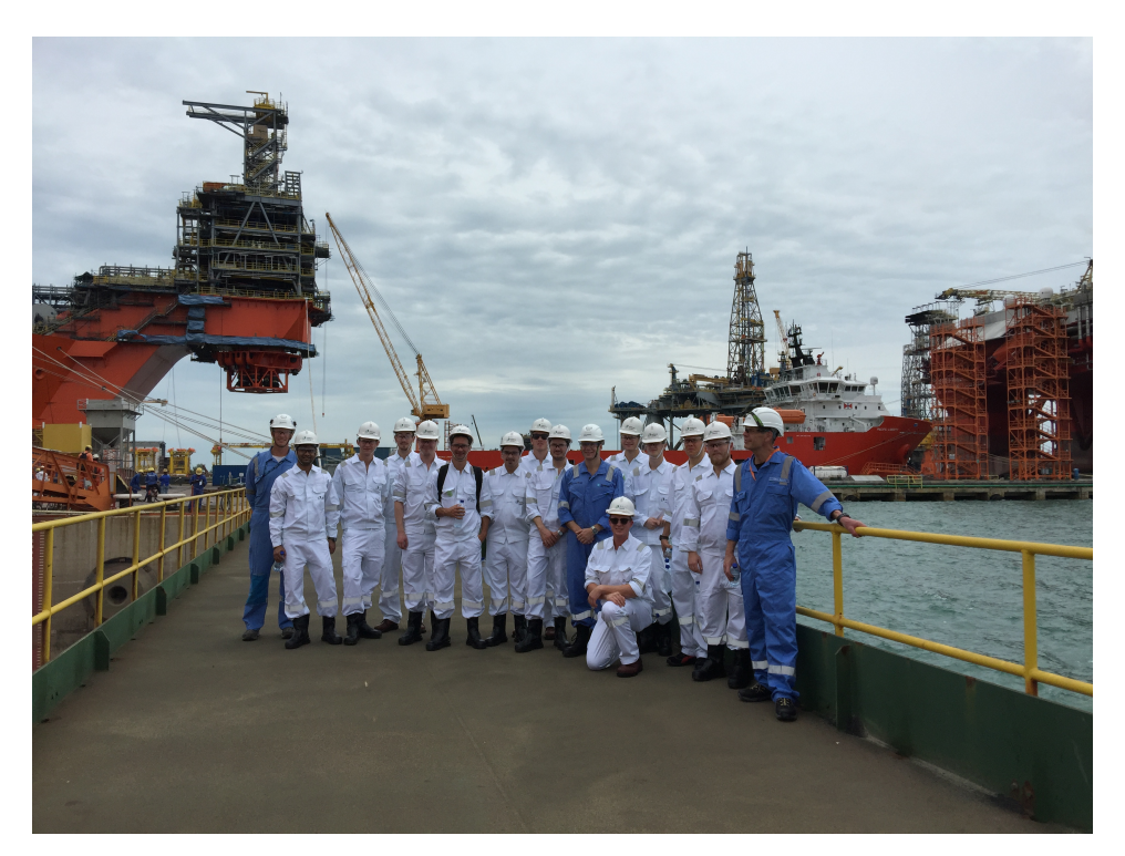
Figure 8: Group photo at Tuas Yard.

We drove to Tuas Yard right after breakfast, where we were lucky enough to spend the full day. The day started with a security briefing and presentations about Tuas Yard and the process of designing a Floating Storage and Offloading (FSO) unit. The presentations were in depth and very technical - much to the delight of the group. After the presentations, we went on a tour of the yard. The size of the yard and the countless workshops left a strong impression on all participants.