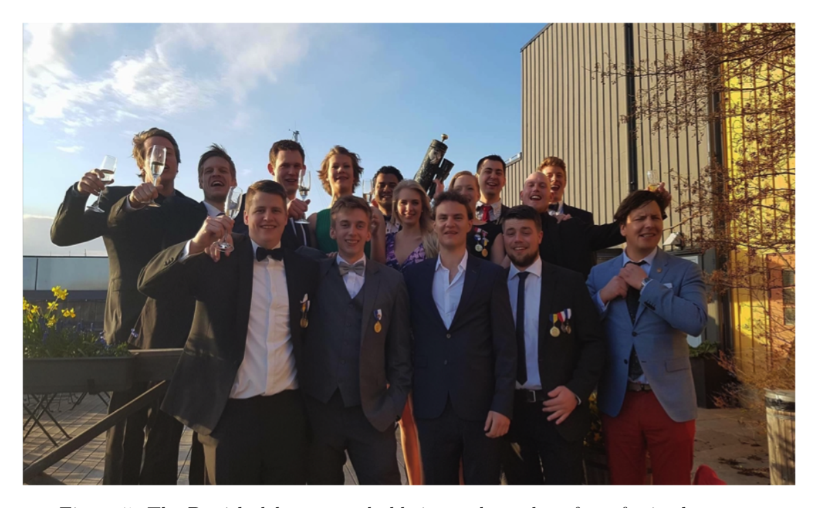
Figure 5: The Danish delegates and old-timers dressed up for a festive banquet.