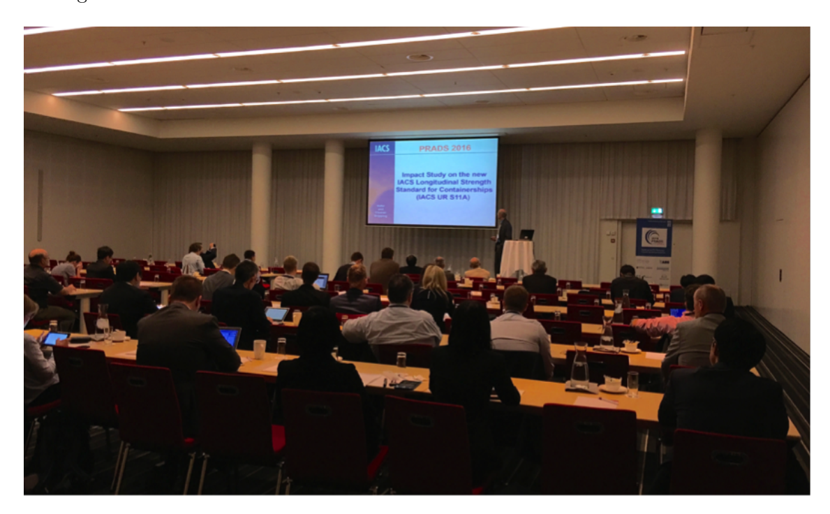
Figure 7: Presentation during the PRADS symposium held at the Crown Plaza hotel, Copenhagen.

The efforts given by the Nul-Kryds team were well recognised by the organising comiteee and the overall symposium was a great successs in further establishing Denmark as a leading maritime nation.