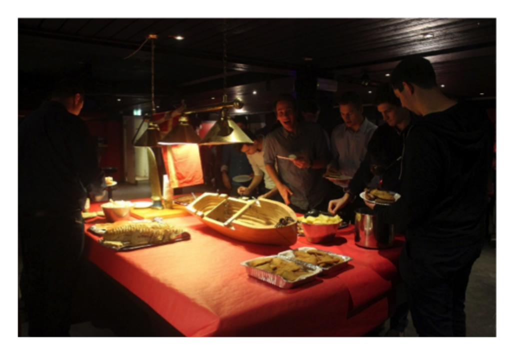
Figure 12: The feast is served.

The best part about the Christmas lunch is the atmosphere. Everyone is welcome, new members as well as old-timers. It is the perfect chance to get reacquainted with old friends and make some new ones. No one is left out. No one was sitting sad in a corner – everyone was having fun - smiling and talking to each other. In the hours before the main course was served, games were played, both "Sink the Ship" and foosball were particularly popular.