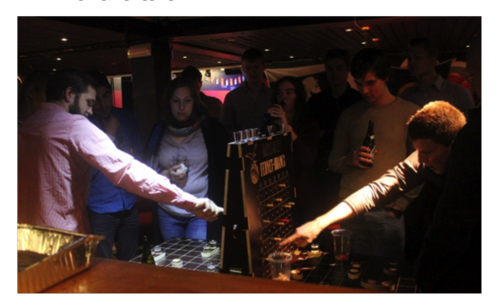
Figure 11: Students gathered around a game of "Sink the Ship".

The 11th of November 2016 was the day of the annual Christmas lunch – the best time of the year. Around 40 people showed up for the festivities! For those who got off early, the doors opened at 16 o'clock. The event was held at Saxen, Kampsax' bar. The evening started with mingling, "glögg og æbleskiver" at around 16.30.