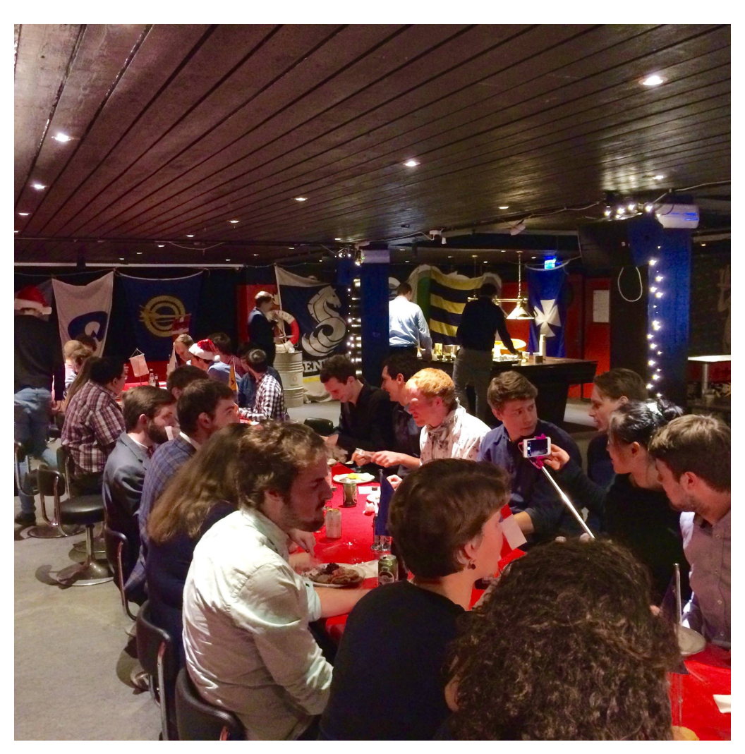
Figure 9: The well-cooked dinner is enjoyed in great company.

The evening proceeded as usual, with plenty of beer, good company and maritime music.