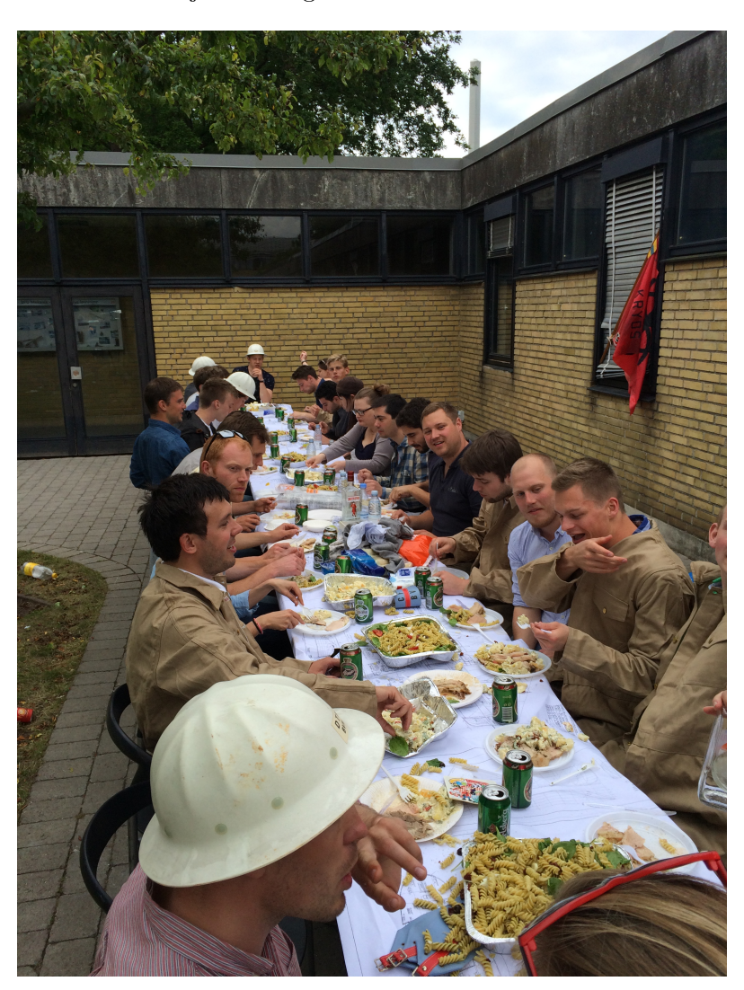
Figure 4: The nice weather allowed us to enjoy the well-cooked dinner outside.

In total everybody had a good evening together with many both old and new like-minded. The picture below indicates just have great an ambiance there is at the Martha evening.