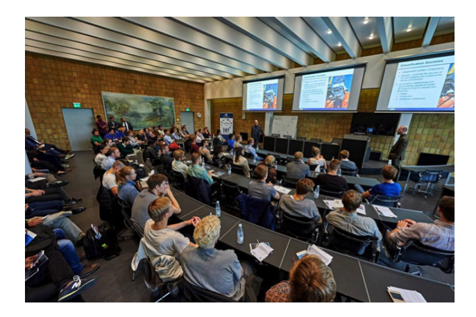
Figure 7: Three presentations were held for the students in order to give them insight into the maritime industry. The board members were amongst the listeners.