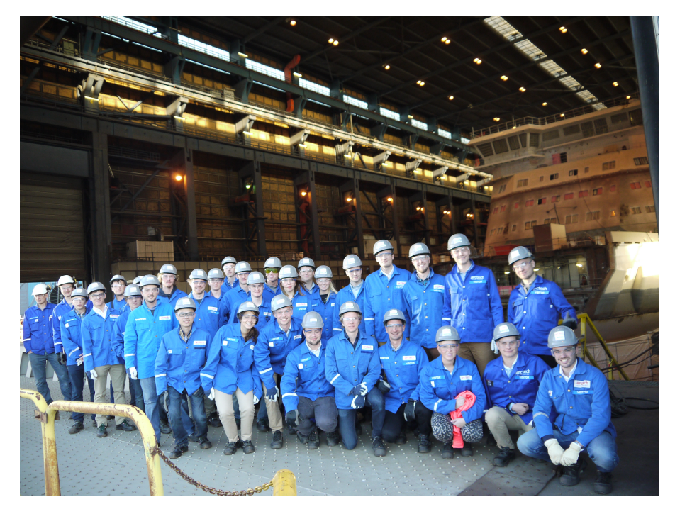
Figure 5: The EMSAC delegates lined up in front of the worlds first LNG powered icebreaker at Arctech Helsinki Shipyard.

It has been decided that Nul-Kryds if possible should participate in EMSAC 2016 as well.